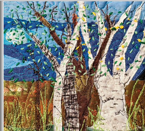
Exhibit: July 1 - Sept 28 • Reception: Aug 15, 1-4 pm

Art will be for sale in an Online Auction • Sept 23 - Oct 2, 2026